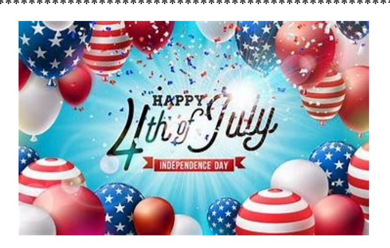
The church office will be closed on Thursday, July 4th in observance of Independence Day!

Please call 1-800-RED-CROSS or visit RedCrossBlood.org and enter: HendersonvilleCM to schedule an appointment