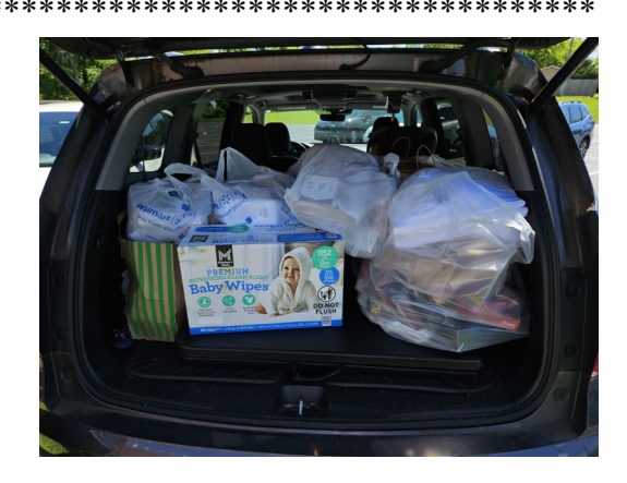
All loaded up for delivery! Thanks for your generous donations to Shower the People.